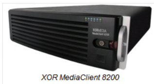
XOR MediaClient 8200

XOR Media (formerly SeaChange Broadcast), developer of high-performance, open, IT storage for media applications and private cloud data centres, has partnered with media software solutions provider Etere to simplify playout workflow by integrating playout with graphics and master control functions as a channel in a box.