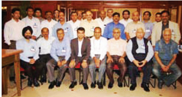
Members of AIBMDA during the first board and AGM in New Delhi

The meeting was attended by 27 senior managers from 25 leading manufacturers and distributors of broadcast equipment in India including AGIV, Advanced Telemedia, Avtech Digital, BEL, Cinecita, DBI, Datavideo, Essel Shyam, Falcon Technologies, Harman,